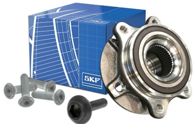
VKBA 6649 F