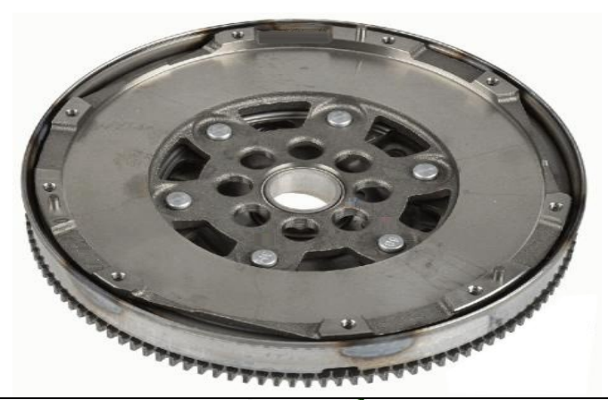
This clutch <u>is</u> suitable for Engine No.s 2494874 -> 3740424 .