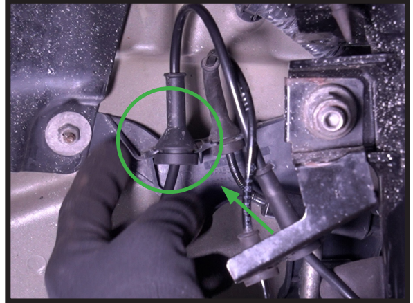
FIGURE 2 FIGURE 3

3. REMOVE SWAY BAR LINK NUT AND WIRE RETAINER BRACKET. (FIGURES 4, 5)