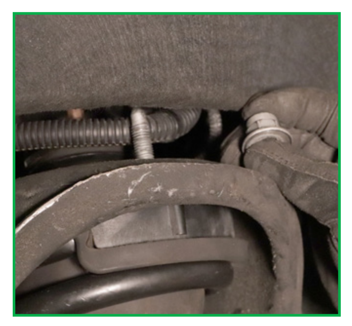
FIGURE 4 FIGURE 5