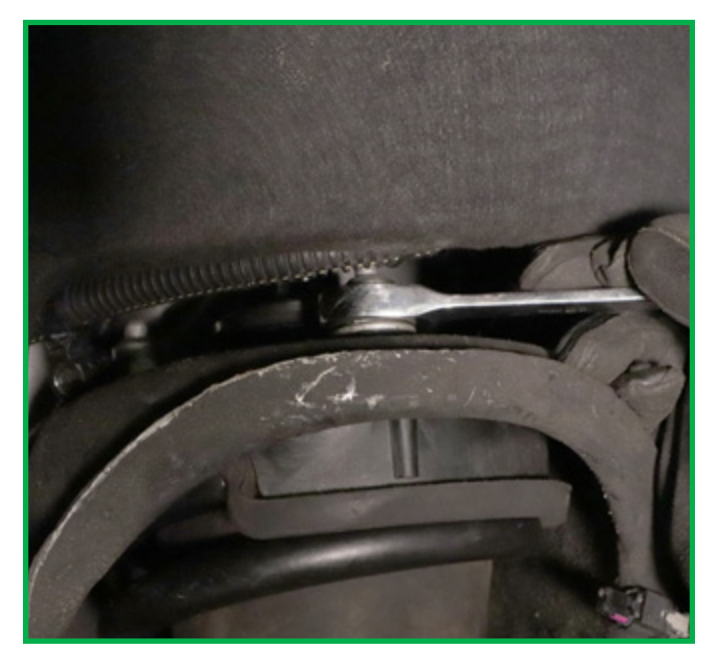
FIGURE 11 FIGURE 12

4. Reroute and connect the electrical connection. (FIGURES 13, 14)