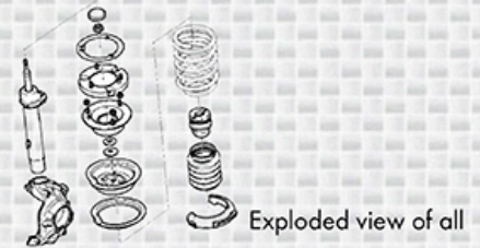
Exploded view of all

Tightening torque : Rod nut : 8.5 da N.m Lower mounting : 12 da N.m Upper mounting : 3.2 da N.m