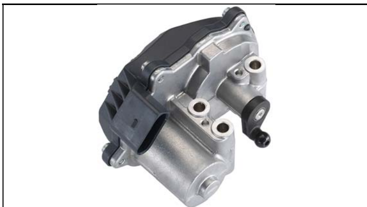
1 - Produkt / Product