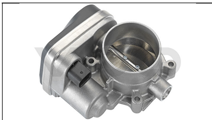
1 - Produkt / Product