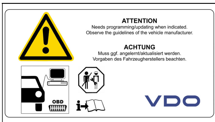
3 - Montage Hinweise / Installation Notes

Nennspannung (Positionssensor) / Nominal Voltage (Position Sensor) = 5 V