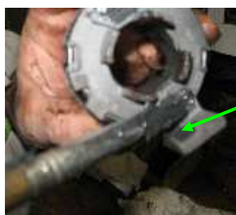
Apply a small quantity of grease