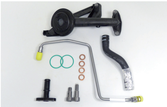
Figure 1: 039 TK17308 000