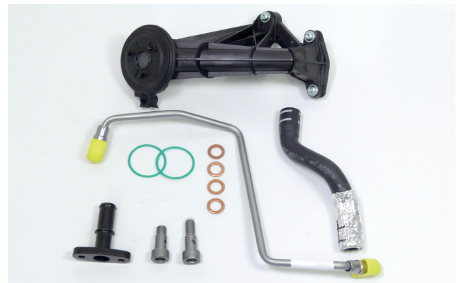
Figure 2: 039 TK17308 010

It is therefore essential that the correct mounting kit be used.