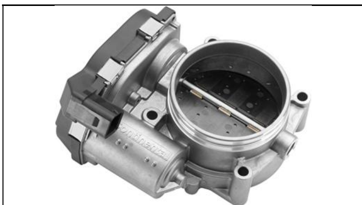
1 - Produkt / Product