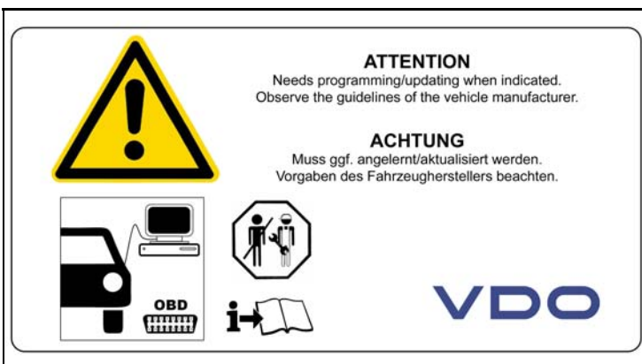
3 - Montage Hinweise / Installation Notes

MLK: Mitgeführter Leerlauf Kontakt (Schalter) / Entrained Idle speed Contact (Switch) IPDK: Istwert Potentiometer Drosselklappe / Actual value Potentiometer Throttle Valve IPA - Istwert Potentiometer Antrieb / Actual value Potentiometer Gear