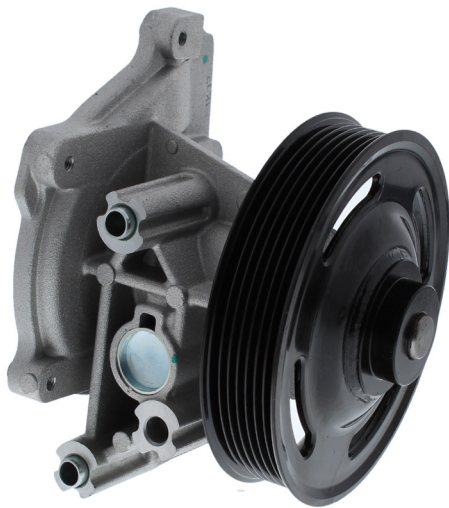
WP6669 without back housing