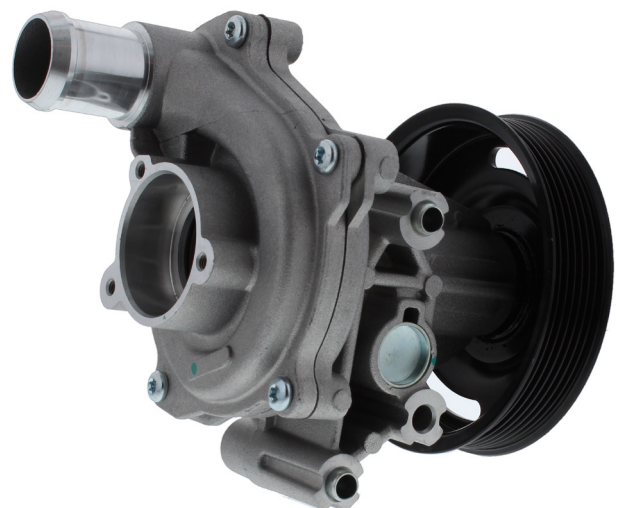
WP6669BH* with back housing

*All part numbers ending BH include back housing