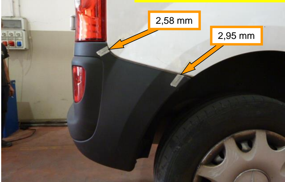
Mercedes Citan 2016