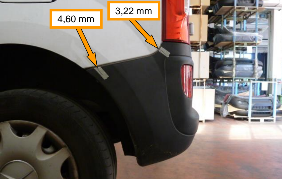
Original Rear Bumper L/H