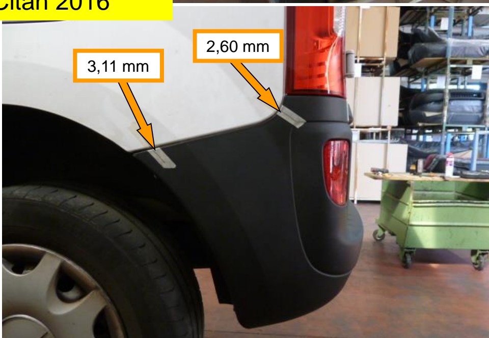
Poliplast Rear bumper L/H