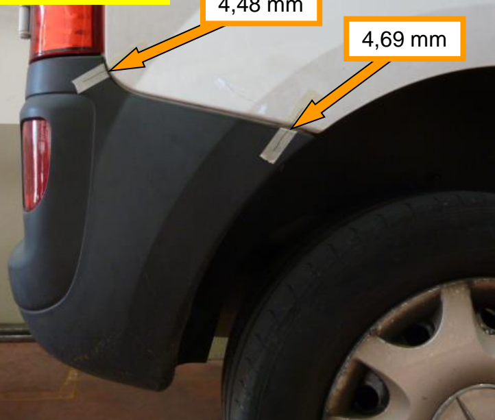
Original Rear Bumper R/H