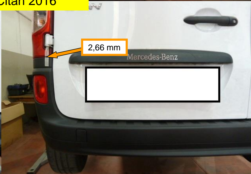
Original Rear Bumper L/H