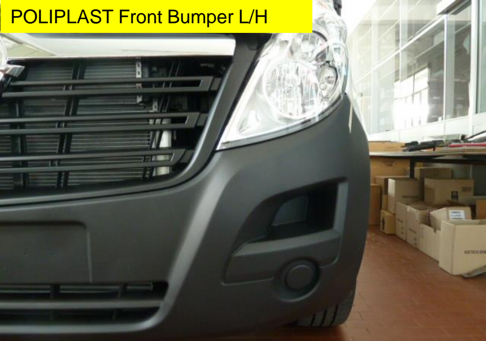
Original Front Bumper L/H