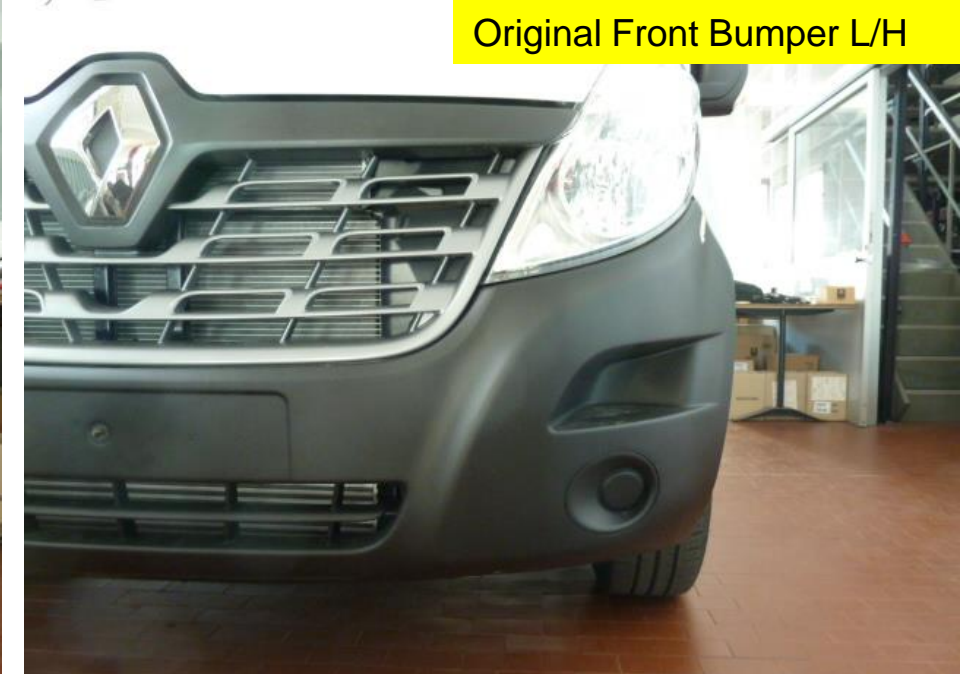
OPEL MOVANO 2009 on