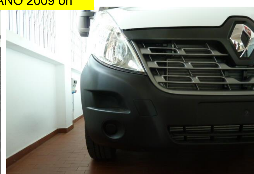
Original Front Bumper R/H