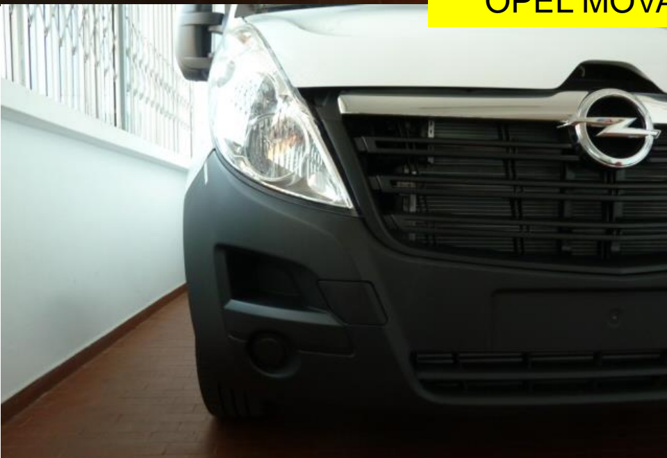
POLIPLAST Front Bumper R/H