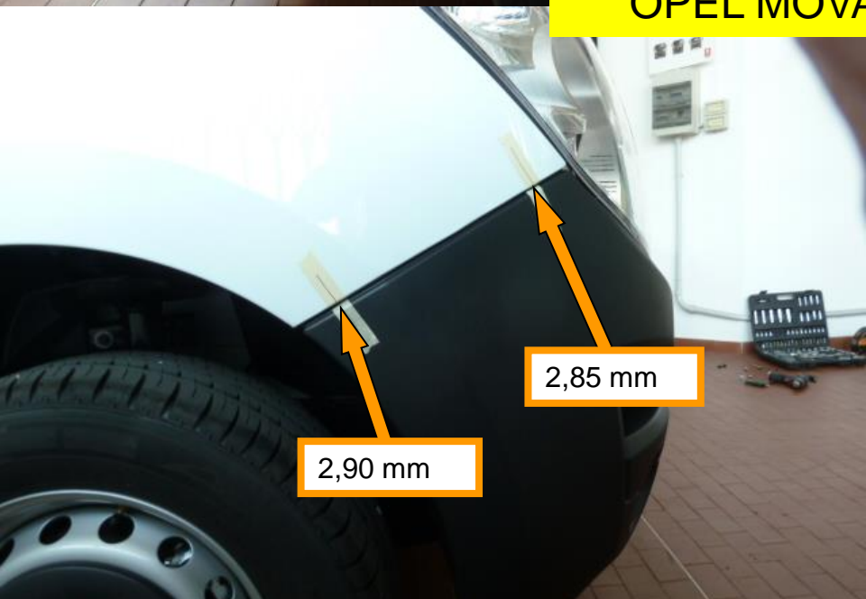
OPEL MOVANO 2009 on