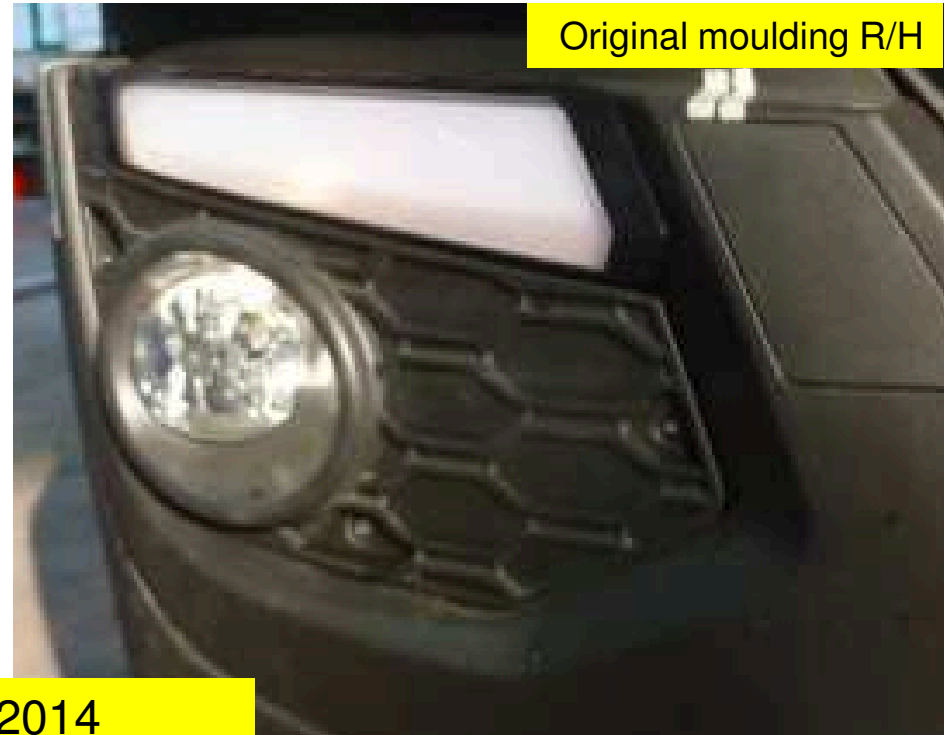
Original moulding R/H