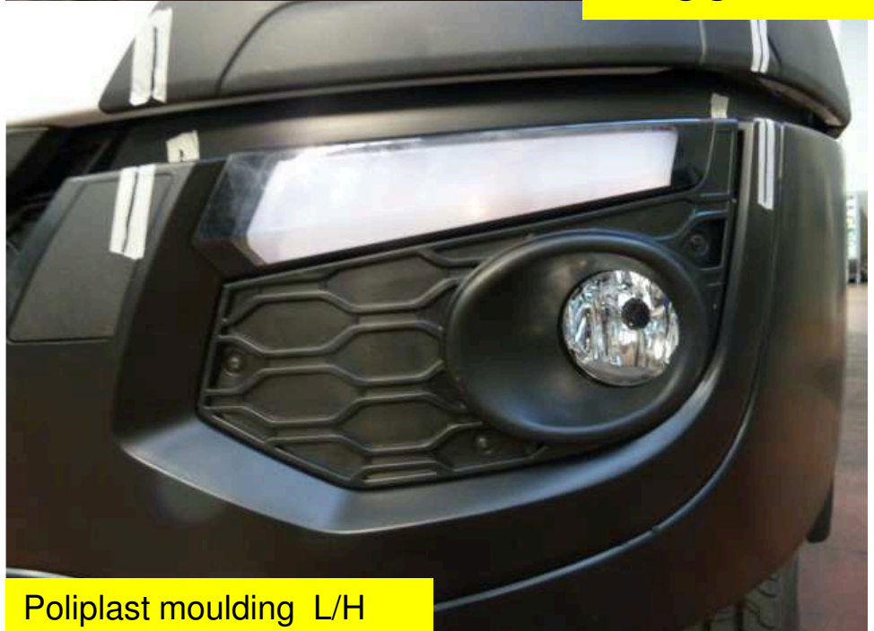
Poliplast moulding L/H