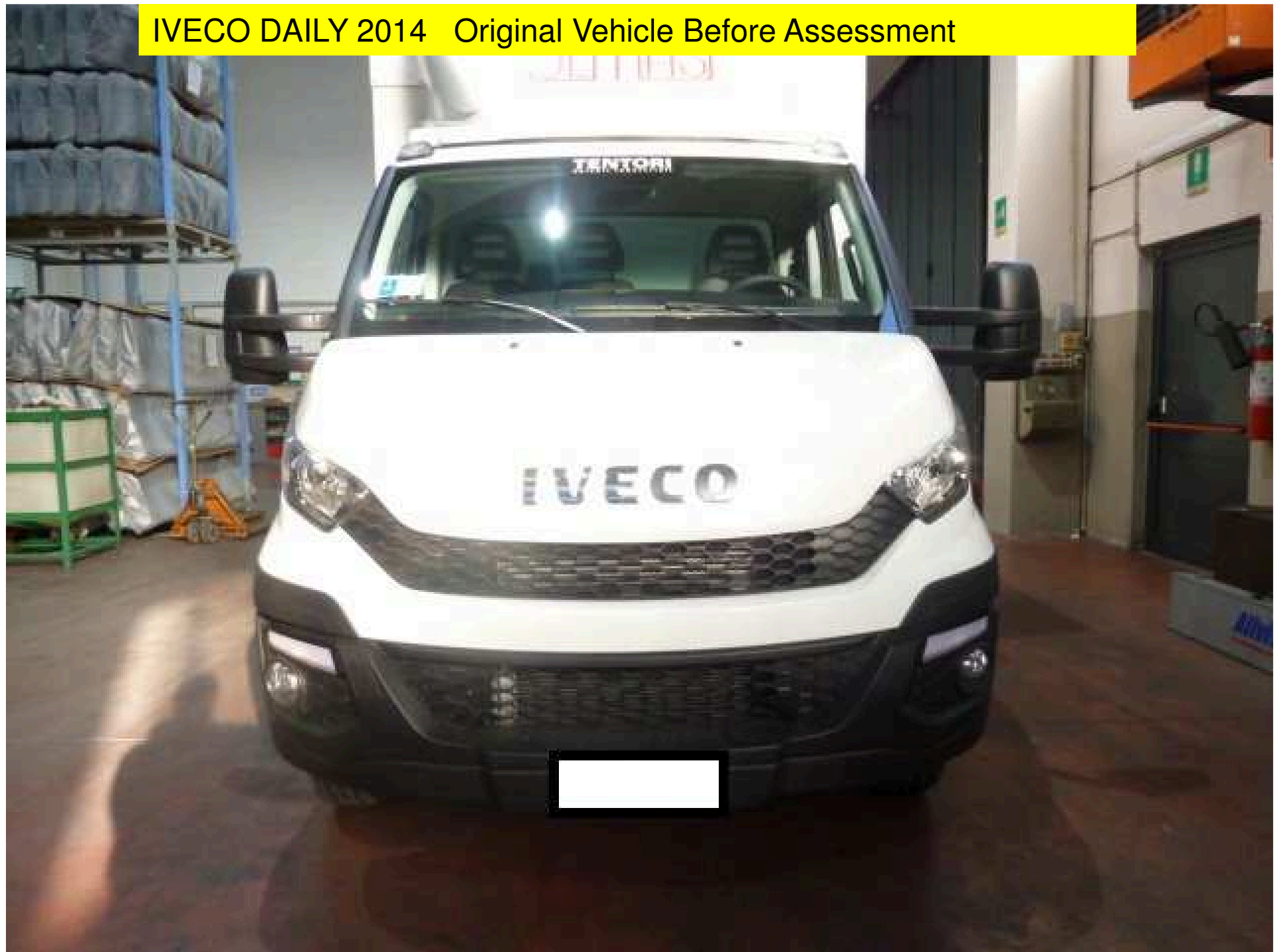
IVECO DAILY 2014 Original Vehicle Before Assessment