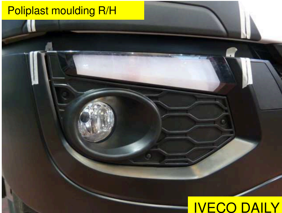
Poliplast moulding R/H